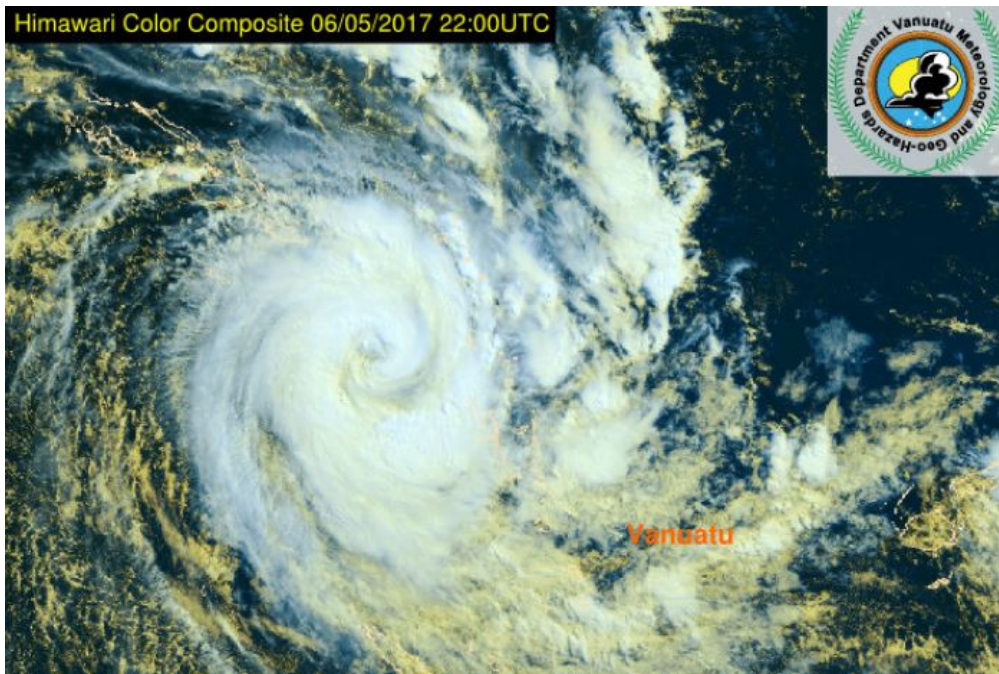
There was tremendous uncertainty about the trajectory of Cyclone Donna.

Schools in New Caledonia have closed for a public holiday on Monday and will stay shut on Tuesday.